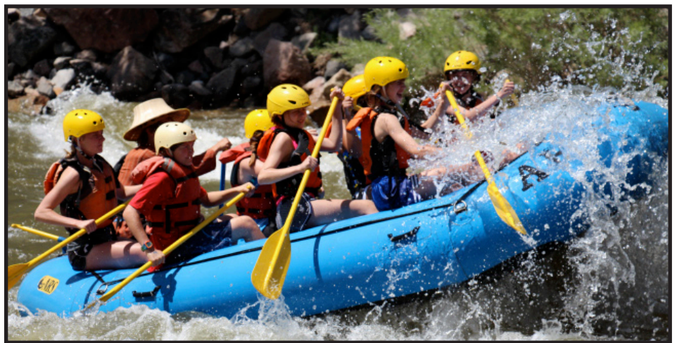
Campers enjoy the rowdy rafting ride down the Arkansas River